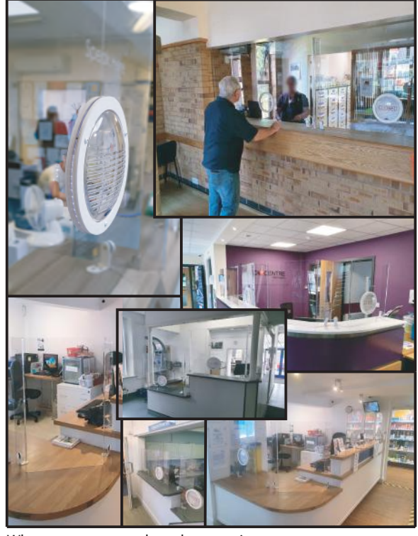
What our customers have been saying.

Installed in multiple UK surgeries, see the list of reasons below as to why you need The Melaphone Defender to protect you, your staff and clients.